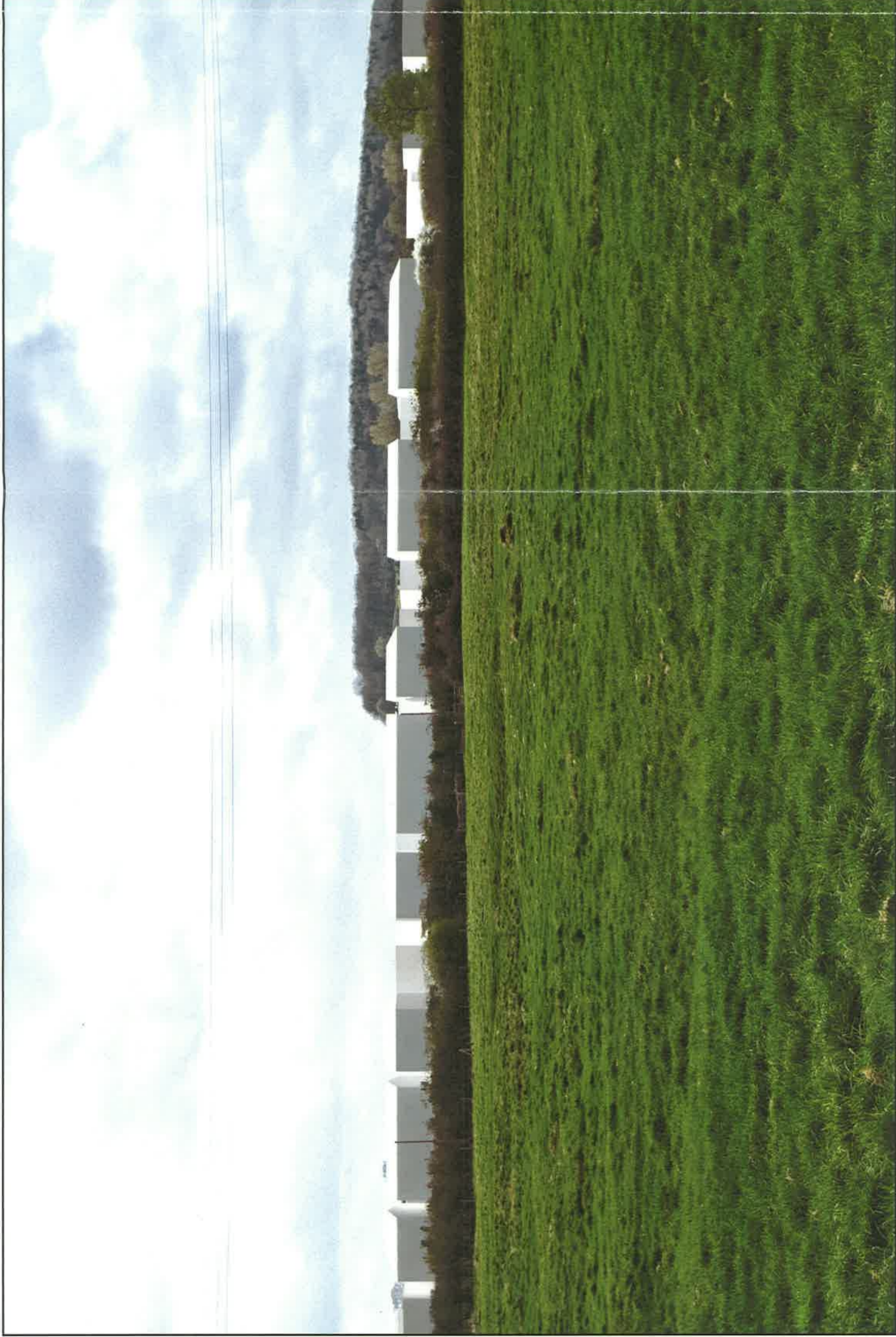
2022 Phase 2 Completion