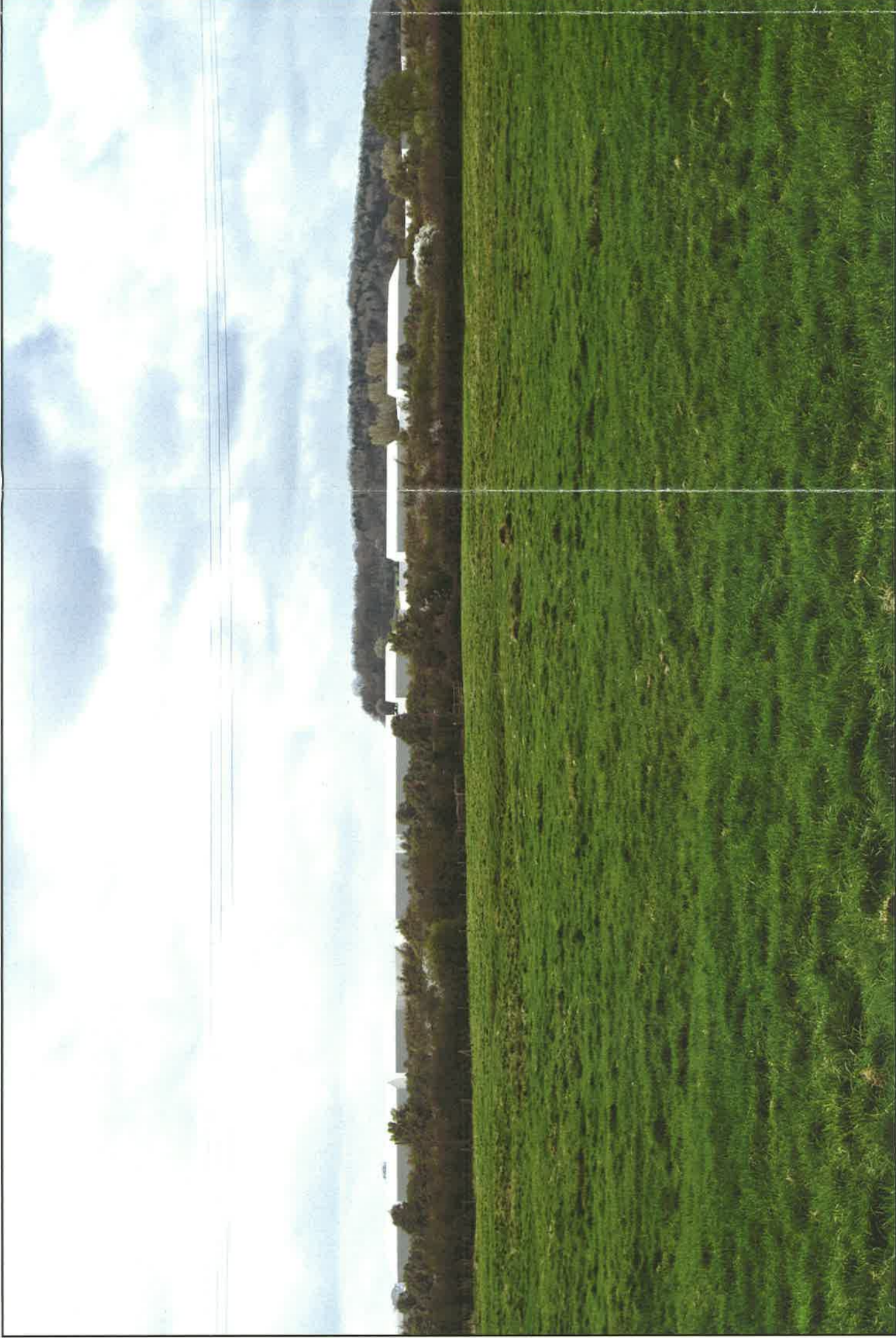
2031 15 Years Post Planting